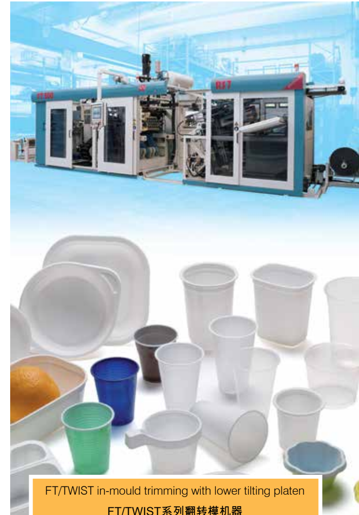
FT/TWIST in-mould trimming with lower tilting platen FT/TWIST系列翻转模机器

IN-LINE extrusion and thermoforming 含挤出机的在线设备