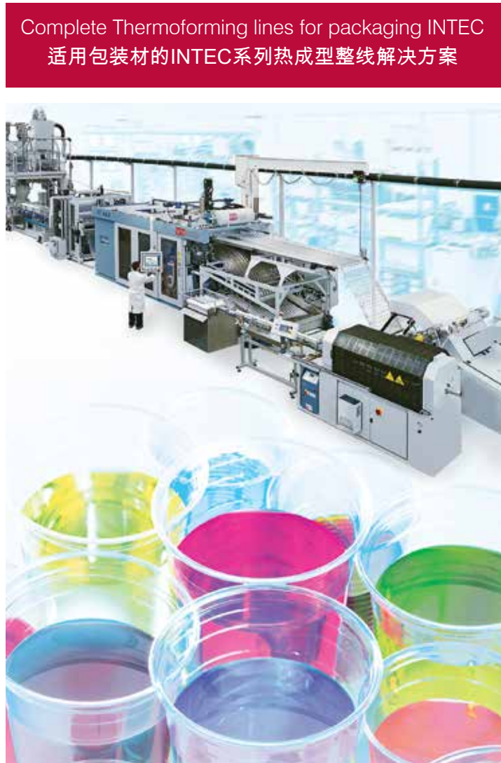
Complete Thermoforming lines for packaging INTEC 适用包装材的INTEC系列热成型整线解决方案

Pressure forming and steel rule cutting machines 正负压成型+钢刀切断