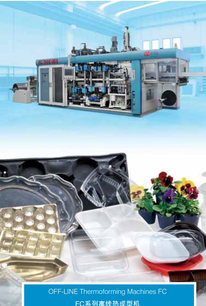
OFF-LINE Thermoforming Machines FC FC系列离线热成型机

Pressure forming and steel rule cutting machines 正负压成型+钢刀切断